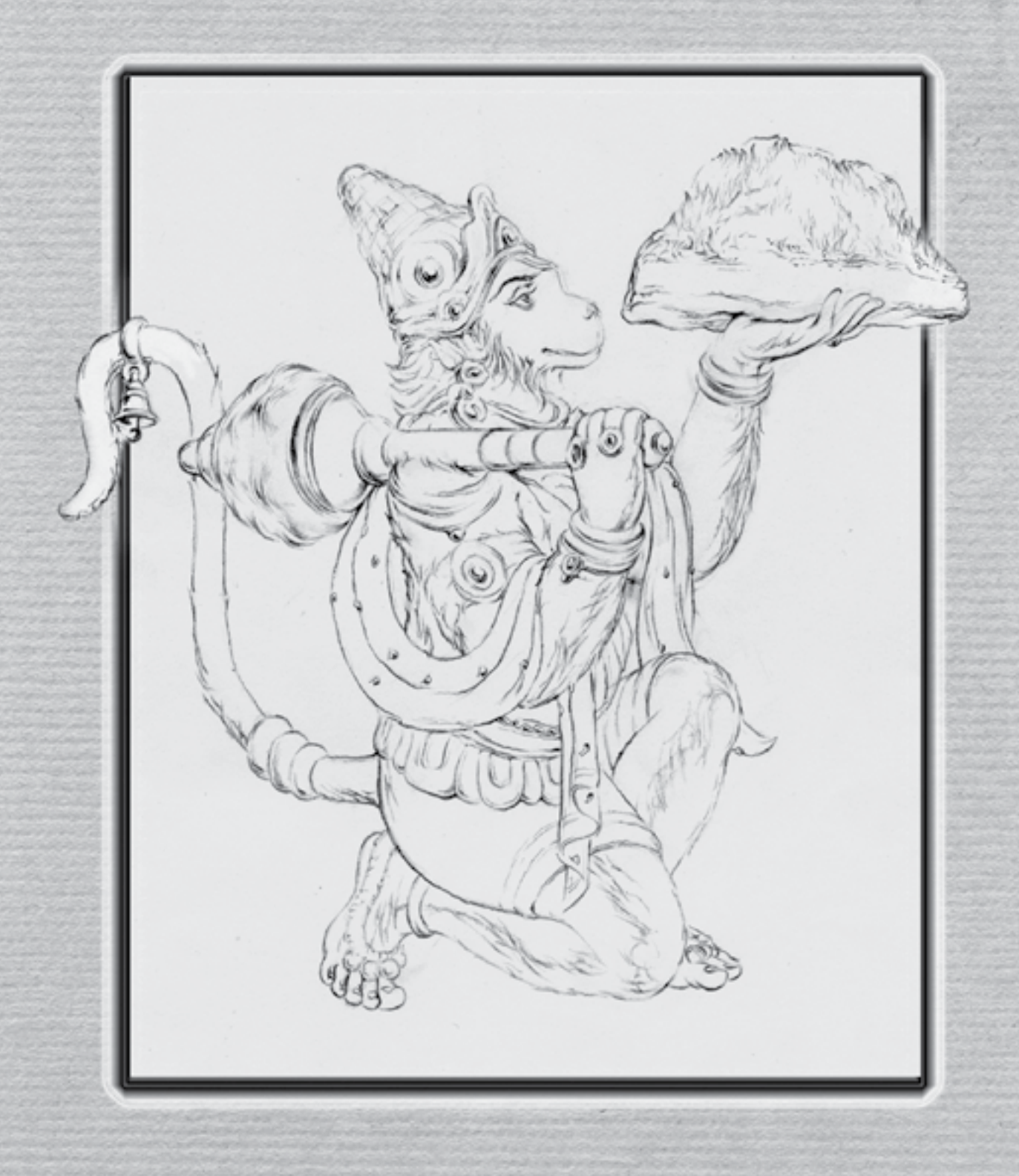
The Newsletter of the ISKCON Health and Welfare Ministry Issue No. 12 / 2006